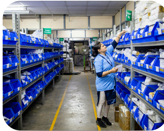
Inventory & Store Management

Powerful support modules that automate core administrative functions, ensuring clinical staff can focus entirely on patient care.