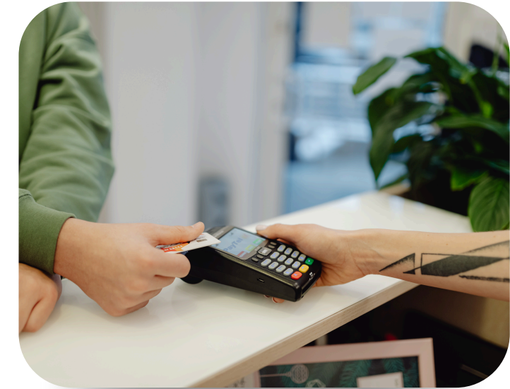
Purchase & Vendor Management