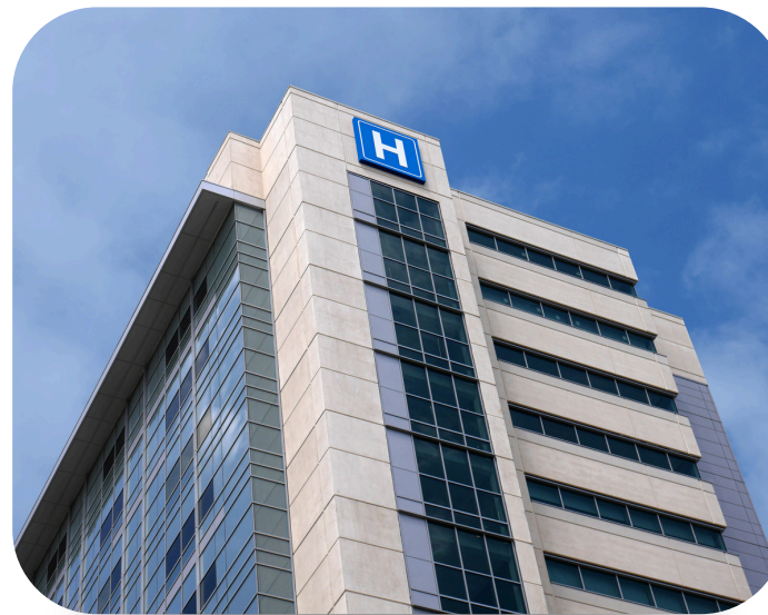
Fixed Asset Management