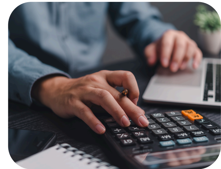
Human Resource & Payroll